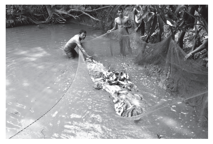
Figure C4.2 Pond polyculture in Bangladesh.

rural markets, as well as fish caught by household members for consumption. Data from consumption surveys carried out in rural Bangladesh are used. In national rural consumption surveys conducted in 1962–1964 and 1981–1982, the average fish intake was 28 g fish/capita/d and 23 g fish/capita/d, respectively (Thompson et al., 2002). Data from household (rural and urban) income and expenditure report fish intakes of 38 g fish/capita/d and 40 g fish/capita/d, in 2000 and 2005, respectively (Bangladesh Bureau of Statistics, 2005).