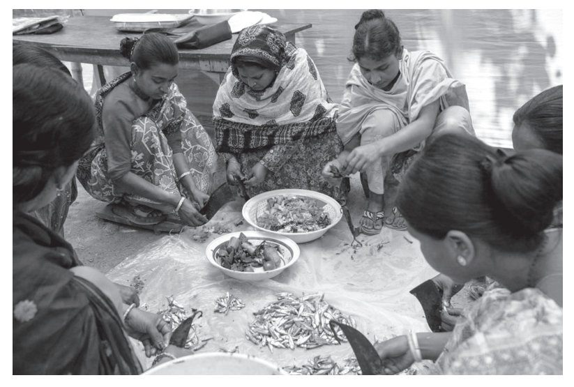
Figure C4.1 Bangladeshi women preparing a fish curry.

and today, with a population of 160 million, the country is considered almost self-sufficient in rice. This has changed the overall agricultural production and management of land and water drastically, favouring rice production: highyielding rice varieties were introduced, more areas were brought under rice production, irrigation was expanded greatly, areas were drained and protected by flood control embankments, and fertilizer and pesticide use increased. Increased agricultural production intensity brought about reduction in soil fertility, decrease in groundwater level and siltation. These changes have been at the expense of inland fisheries; the area of inland waterbodies and the duration of inundation have fallen, with degradation and loss of fish habitat, as well as obstruction in fish movement to floodplains (Craig et al., 2004).