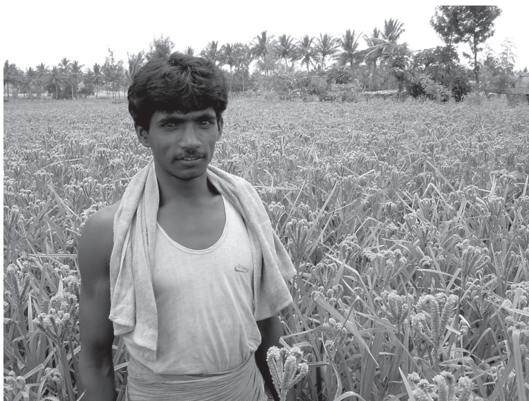
Figure C8.1 Farmer from Karnataka State in his finger millet field.

Minor millets are nutritionally comparable or even superior to staple cereals such as rice and wheat (Gopalan et al., 2004; Geervani and Eggum, 1989). Compared with rice, 100 g of cooked grain of foxtail millet contains