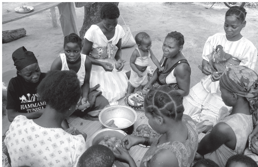
Figure C5.2 Women preparing sweet potato as part of porridge preparation during a group nutrition session.