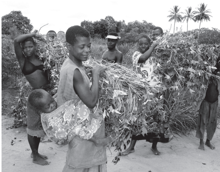
Figure C5.1 The project specifically targeted women with small children to receive OFSP vines.