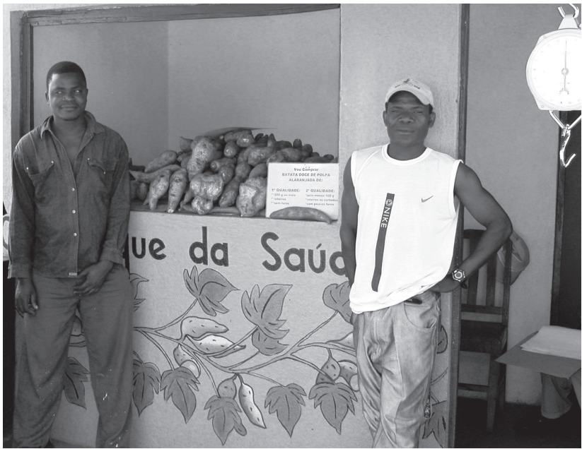
Figure C5.4 OFSP traders standing in front of their decorated roadside sales stall.